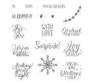
Tin Of Tags Photopolymer Stamp Set [142180] $21.00