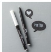
White Stampin Chalk Marker [132133] $3.50