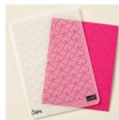
Happy Heart Textured Impressions Embossing Folder [137364] $7.50