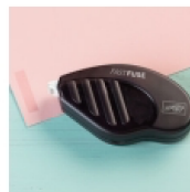
Fast Fuse Adhesive [129026] $10.00