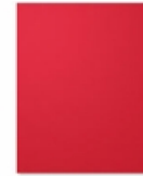
Real Red 8-1/2" X 11" Card Stock [102482] $8.00