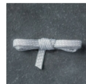
Smoky Slate 1/8" (3.2 Mm) Stitched Ribbon [141687] $6.00